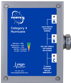
Nipple Mount Version